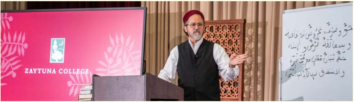
President Hamza Yusuf teaching at a Zaytuna Enrichment Lecture